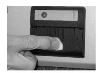
PRESS BUTTON TO RELEASE PAPER COVER

The printer requires special thermal paper which can be obtained from the suppliers. To fit the paper roll:-