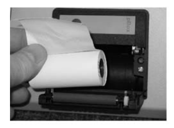
REMOVE EMPTY ROLL HOLDER PLACE NEW ROLL INTO THE MECHANISM, ENSURE THERMAL COATING IS UPPERMOST