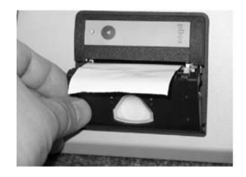
CLOSE COVER TO RETAIN THE PAPER AGAINST THE ROLLER. ENSURE LID CLICKS FIRMLY SHUT