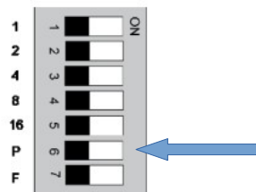
Dual in Line Switch.

A – Higher level options 1 – 4 are only available when the program switch is set to on. (Dil switch 6)